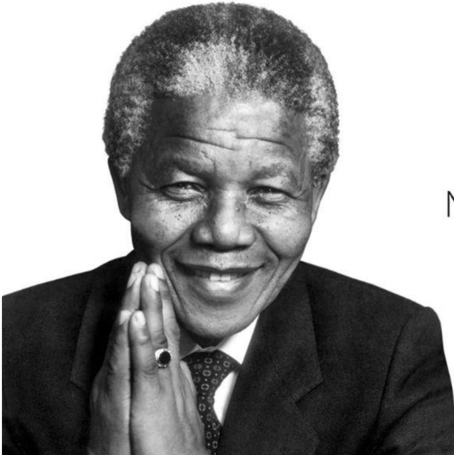
Nelson Mandela 1918-2013